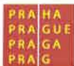
The City of Prague